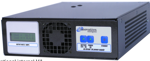
Optional internal V/I meter shown