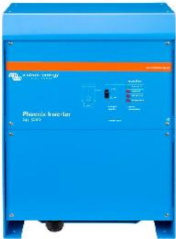
Phoenix Inverter 24/5000