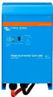
Phoenix Inverter Compact 24/1600

All models have a RS-485 port. All you need to connect to your PC is our MK2 interface (see under accessories). This interface takes care of galvanic isolation between the inverter and the computer, and converts from RS-485 to RS-232. A RS-232 to USB conversion cable is also available. Together with our VEConfigure software, which can be downloaded free of charge from our website, all parameters of the inverters can be customised. This includes output voltage and frequency, over and under voltage settings and programming the relay. This relay can for example be used to signal several alarm conditions, or to start a generator. The inverters can also be connected to VENet, the new power control network of Victron Energy, or to other computerised monitoring and control systems.