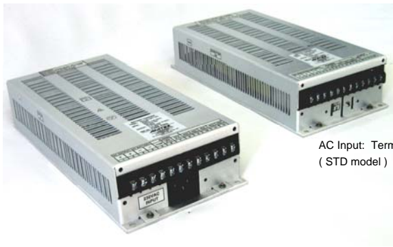
AC Input: Terminals ( STD model )